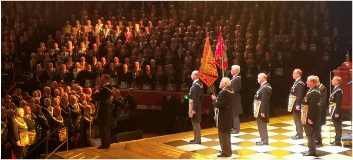
Somehow in the spotlight at the magnificent Tercentenary Celebration at the Royal Albert Hall-2017