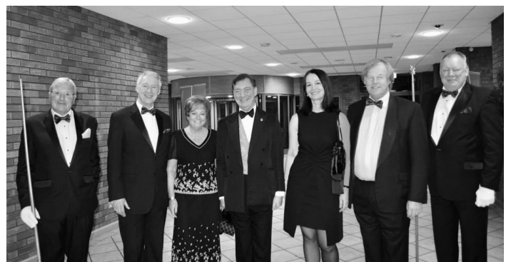
The 2022 Festival launch at the Chateau