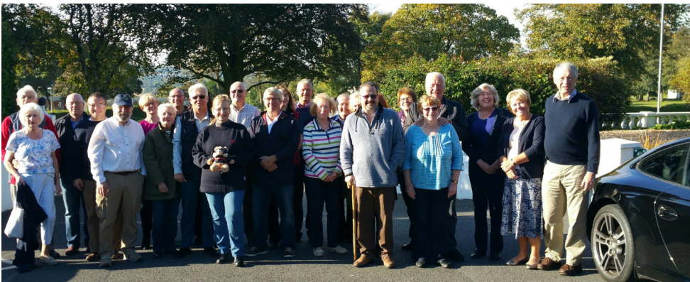
One of WMMC's many great events