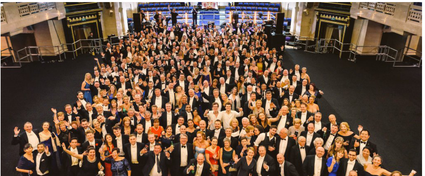
Dancing in the Grand Temple - the Tercentenary Ball

"To be fifty years a mason and a Provincial Grand Master of a province I suspect is a rare event. On behalf of the Provincial Grand Lodge of Warwickshire I want to extend our enormous congratulations on achieving this tremendous milestone. We are incredibly proud of the relationship we have between Warwickshire and Worcestershire. You are a special man and deserve all the accolades."