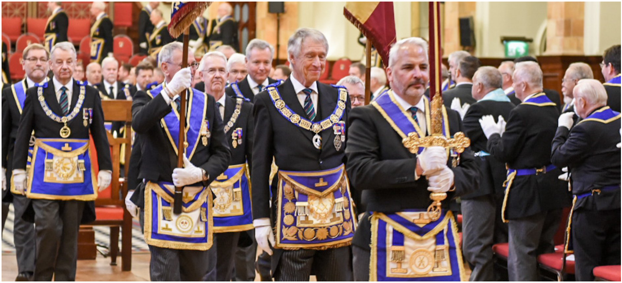
My last Provincial Grand Lodge - 2021