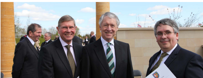
The Dedication of Staffordshire's Memorial Garden at the National Arboretum - 2017