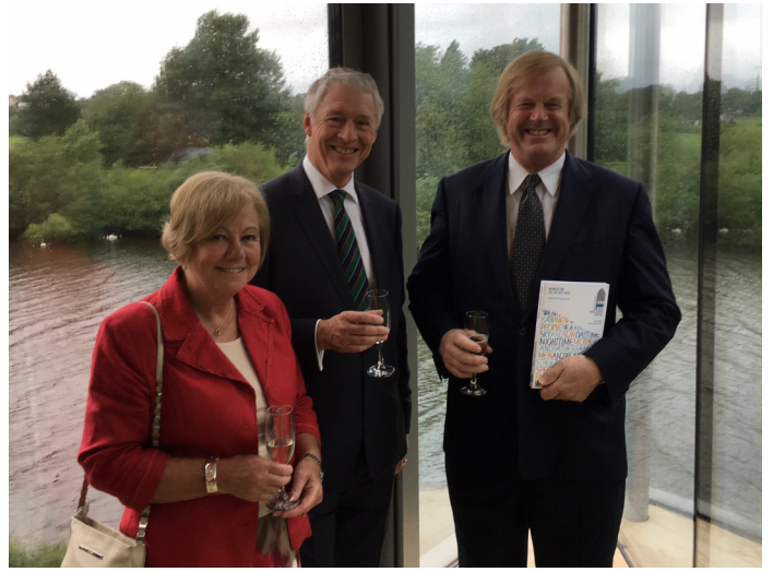
Three Choirs Festival Tercentenary Concert at Worcester