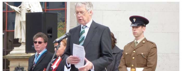
ANZAC Day Birmingham. The 2015 Centenary