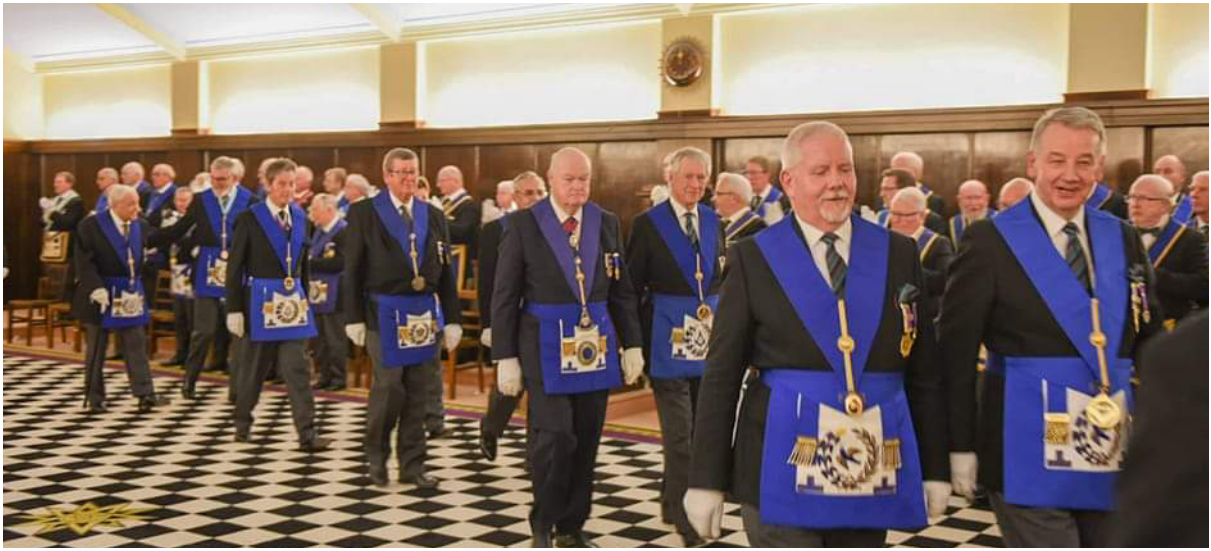
The biggest surprise of all. The Pro GM coming to my 50th.