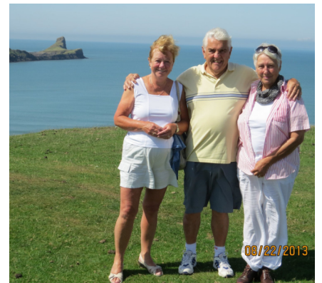
With the Gwynns at their beloved Gower