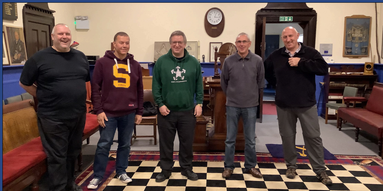
Cubit Club COI at Malvern

The next regular class of instruction meeting took place in Malvern during October. A great time was had by all that attended!